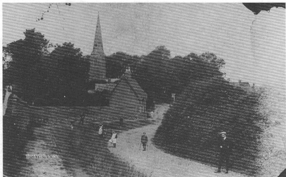
BRAYBROOK, c. 1907. Looking north towards the village from the road to Arthingworth.